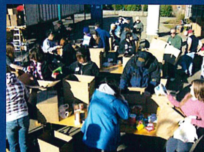
The Davidson & Associates Insurance crew of staff, family and friends helping with a past Walk & Knock day.