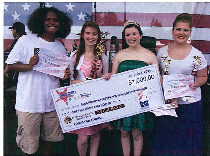
Here are the top 4 finalists from last years competition.

We are once again co-sponsoring the Sing Fourth Vocal Competition with PEMCO Insurance held on the 4th of July on the Main Stage at Fort Vancouver. Every year the Teen Vocal Competition kicks off the action at the Fort Vancouver Independence Day Celebration with a bang! Ten outstanding youth vocalists will compete for